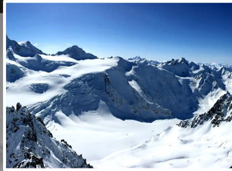
Cambria Ice field

Soar high among grizzly, salmon and goat country alongside high Alaskan snowy peaks while taking in the beauty for miles around.